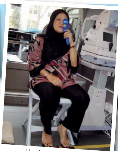
Here's looking at you - visual acuity check