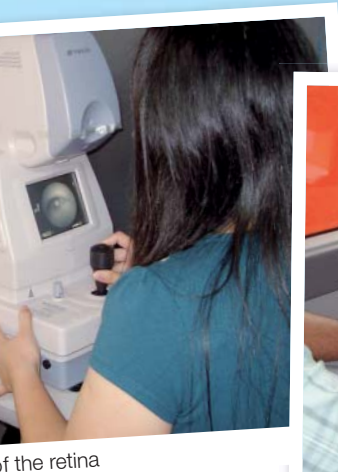
of the retina