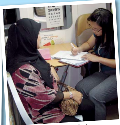
Let me jot your details down

1 Woodlands Street 31, #01-02 Fuchun Community Club, Singapore 738581